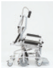
8° Anterior tilt