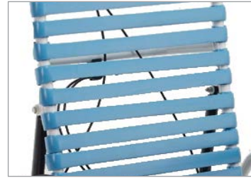
Individualized fit for superior comfort